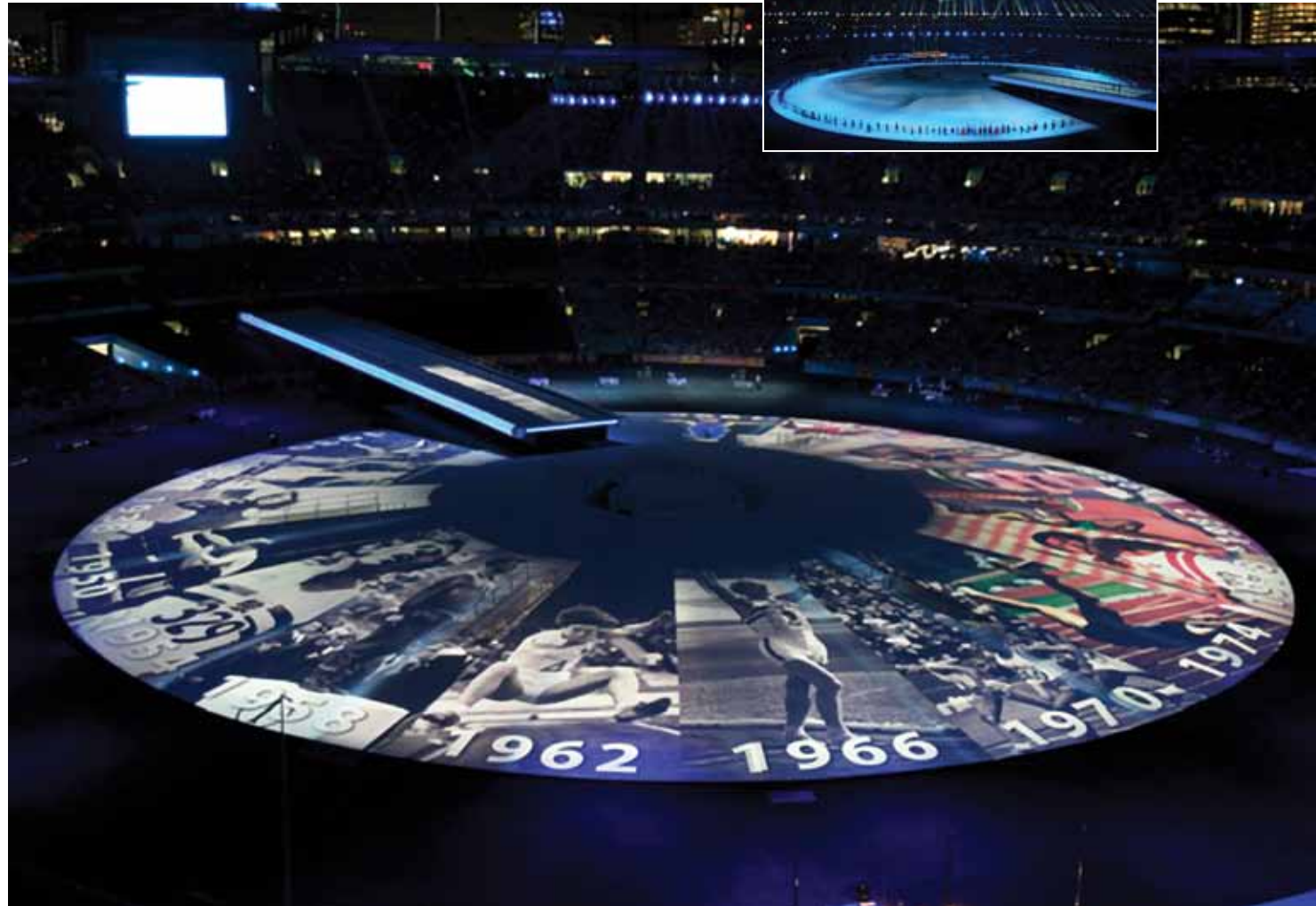
"The XVIII Commonwealth Games opening and closing ceremonies."